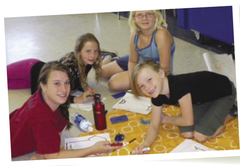
Town youth learn about the importance of energy conservation at a summer camp.

The Green Plan Progress Report Card is an opportunity to highlight our key achievements. Action has already been taken on about 91% of the Green Plan's 70 recommendations!