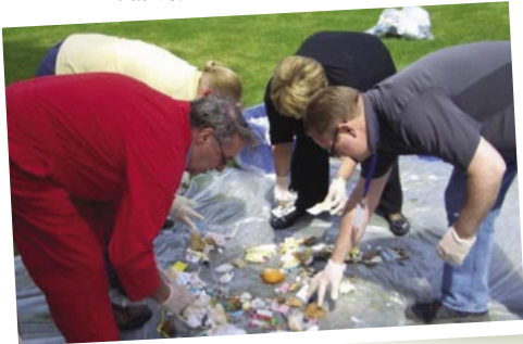
Members of the Staff Sustainability Team complete a Waste Management Audit.