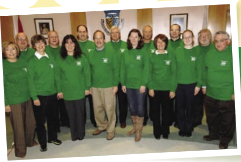
In 2007, the Mayor's Green Plan Task Force led the development of the Green Plan.